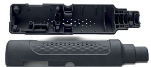
Figure 2: HP 3D HR PA 12 GB part courtesy of NACAR