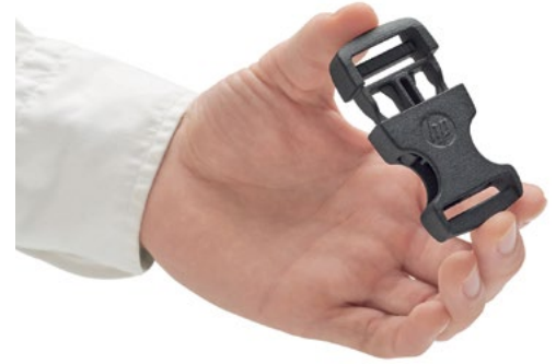
Figure 3: HP 3D HR PA 11 part courtesy of NACAR

The mechanical properties of HP 3D HR PA 12, HP 3D HR PA 12 GB, and HP 3D HR PA 11 in the HP Jet Fusion 4200 3D Printing Solution and the HP Jet Fusion 5200 Series 3D Printing Solution have been characterized in the HP 3D Printing materials for the HP Jet Fusion 4200 3D Printing Solution – Mechanical Properties and HP 3D Printing materials for the HP Jet Fusion 5200 Series 3D Printing Solution – Mechanical Properties white papers, respectively.