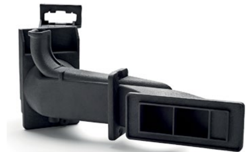
Figure 1: HP 3D HR PA 12 part after graphite blasting post-processing